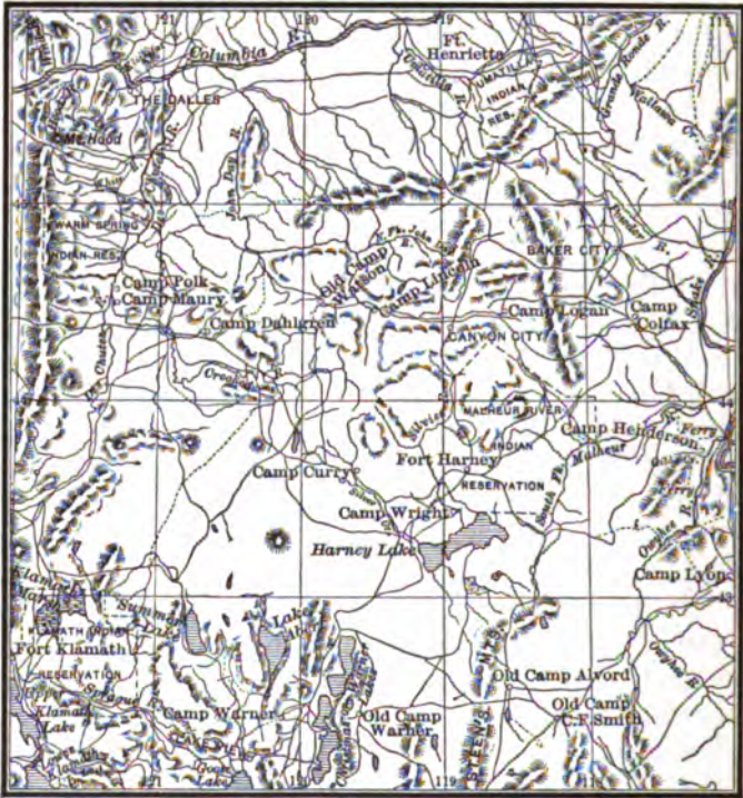
EASTERN OREGON, CAMPS AND FORTS.